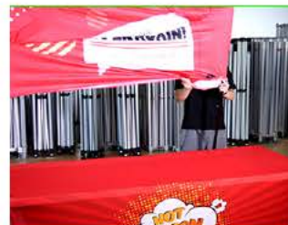
5 Make necessary adjustments