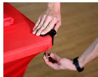
2 Fix the C clamps on the left and right edge of the table respectively