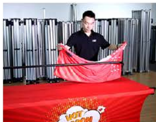
4 Set the graphic on the frame