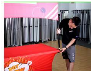
6 Attach the frame to the C clamps and fasten with the screws