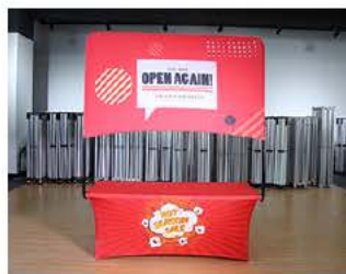
7 The setup is finished